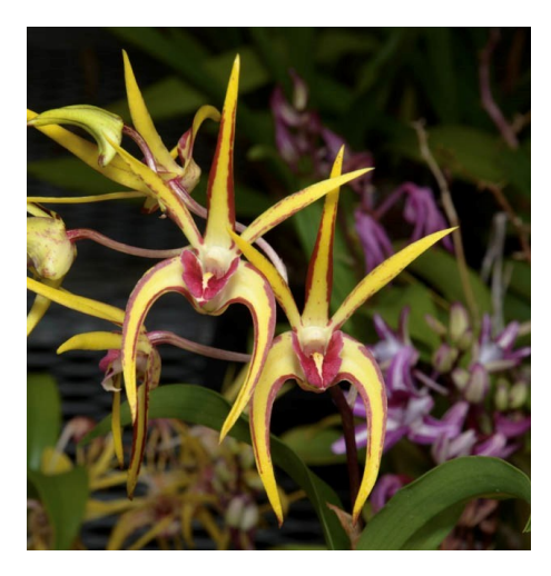
Den. Victorian Regency 'Red Stripe