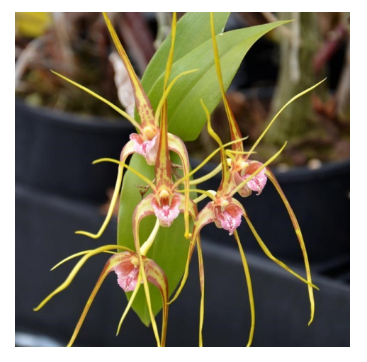
Den. tetragonum 'Red Lip'