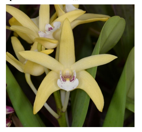
Den. (Golden Vista x Dunokayla)