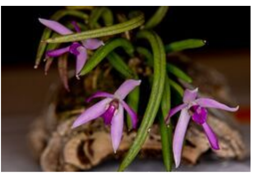
Leptotes pohlitinocoi – Debra Amis